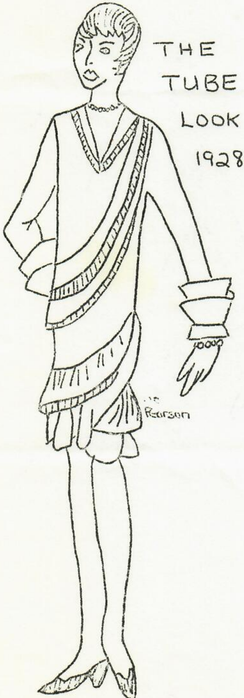
THE TUBE LOOK 1928